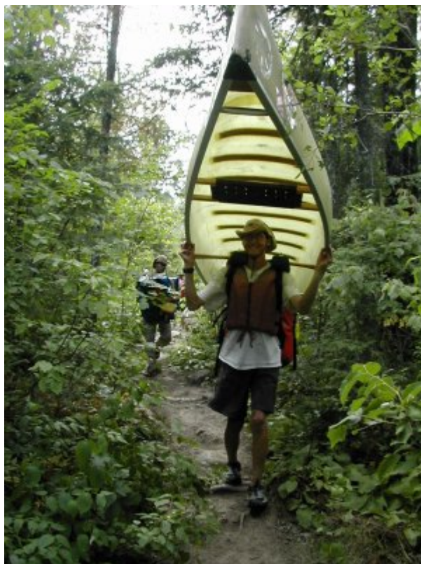
Portaging in Canada