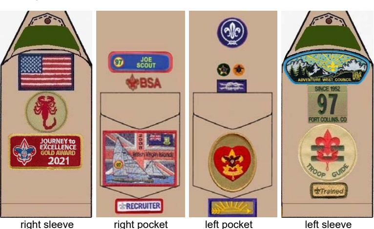
right pocket Uniform Insignia

Unacceptable Items (applies to everyone on any Scout activity)—BSA policy forbids wearing any garment that displays pictures or messages that are inappropriate to youth activities. These include items with "adult" or sexual content or foul language, racial/ethnic/religious/etc stereotypes or slurs, or anything displaying the name or image of alcohol, smoking/vaping, or marijuana products. Clothing with political messages is also inappropriate.